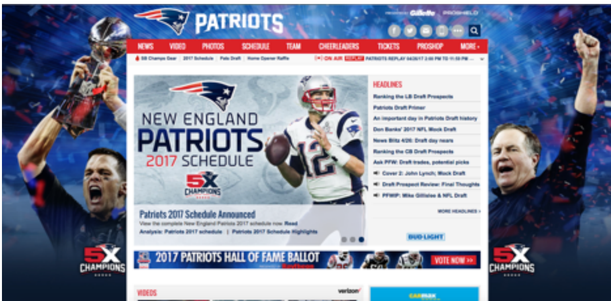
Figure 1. Brand personality displayed on the New England Patriots’ homepage.

The study found that each team’s website exhibited the three main elements of branding as determined from the literature review. Brand personality was evident by the incorporation of team colors, logos, fonts, and player images, as well as the tone conveyed through various images and text. When looking at the homepage, it is clear which team’s website the viewer is visiting, and the tone conveyed by the site seems to fit with the general personality associated with that organization. An example of the inclusion of brand personality on the team’s homepage is represented in Figure 1 . The New England Patriots are known for their five Super Bowl championships, and for having a superior attitude in comparison to other NFL teams. The depiction of quarterback Tom Brady and head coach Bill Belichick posing victoriously with the Lombardi trophy and the multiple mentions of “five-time champions” on the homepage align with the Patriots’ boastful brand personality.