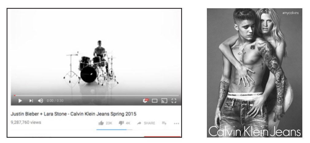
Figure 5. #MyCalvins video campaign (left) and #MyCalvins print campaign (right)

A hashtag, #MyCalvins, is incorporated into the campaign for audience engagement. The campaign video incorporated narratives of self-expression, sexuality, and pop culture and targeted young Millennials between the ages of 18-25, with singer Justin Bieber as the social influencer. In the video campaign description, it also encourages the audience to participate in the campaign by showing their own #MyCalvins look on social media. Following the release of the video campaign, Calvin Klein released a "micro-site" where the best user-generated content was recognized by the brand.