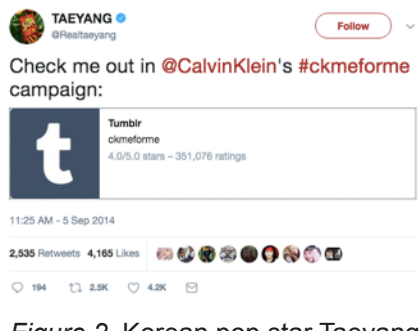
Figure 2. Korean pop star Taeyang invites his Twitter followers to check out the #ckmeforme Tumblr page

For consumer engagement, the campaign includes a hashtag, #CKmeforme, to encourage the audience to participate and engage with the influencers of the campaign. A Tumblr page was also created, where the influencers posted content, and the audience was able to like, comment, and repost the content. Through the Tumblr page, fans found the CK One Snapchat account, while others found it through the influencers' personal social channels. On Snapchat, content disappears within 24 hours, but users were able to view posts from the campaign on Snapchat during that time period. On Tumblr, users could like posts from the campaign's Tumblr page, as well as repost them onto their own Tumblr blogs. On Twitter, users could retweet or like tweets from the official Calvin Klein Twitter account, as well as other users' Twitter pages.