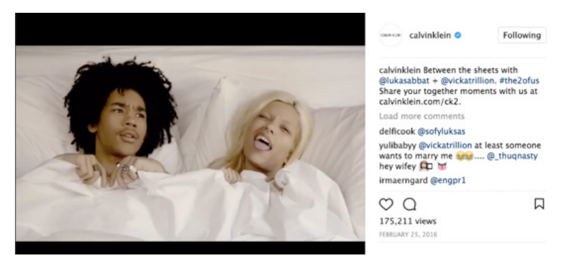
Figure 4. ck2 Instagram post. Caption: "Between the sheets with @lukasabbat + @vickatrillion. #the2ofus Share your together moments with us at calvinklein.com/ck2

Three months after the release of the video campaign and the hashtag #the2ofus, Calvin Klein released an Instagram post in February 2016, featuring stars of the ck2 campaign. It invited users to "share your together moment" at calvinklein.com/ck2 to further interact with the campaign. Users could like and comment on influencers' sponsored content on Instagram and could post their own with the hashtag #the2ofus. Users could tweet with the hashtag, like, and retweet other users, as well as comment on the YouTube video campaign, like, and reply to other users' comments.