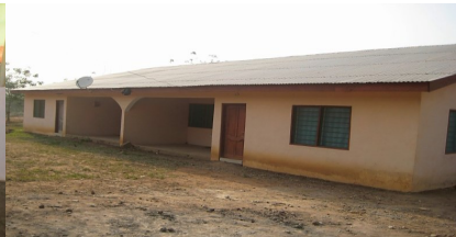
First block of Staff Housing