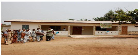
Health Center on Opening Day in January 2009