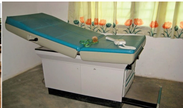
Inside the Health Center