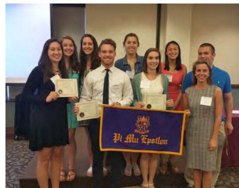
The new members of Pi Mu Epsilon 2017