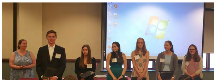
The new members of Mu Sigma Rho 2017