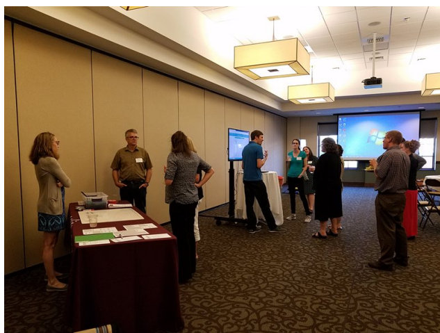
The conference is in full swing!