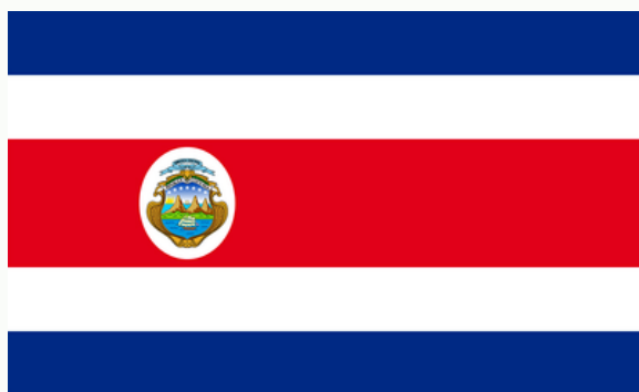
COSTA RICAN FLAG

The Class of 2023 has spearheaded marketing efforts for the Periclean Class of 2025. The application closes on March 4, 2022 for first year students.