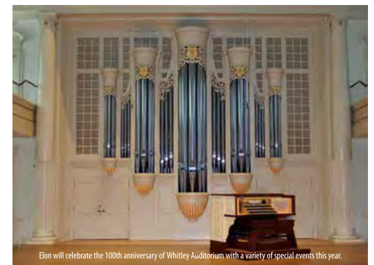
Elon will celebrate the 100th anniversary of Whitley Auditorium with a variety of special events this year.

Jan. 19-23 & Feb. 2-3 Department of Performing Arts presents "The Antipodes" by Annie Baker, Roberts Studio Theatre, Scott Studios at Arts West, Jan. 19-20, 22-23 and Feb. 2-3 at 7:30 p.m.; Jan. 21 and Feb. 3 at 2 p.m. R